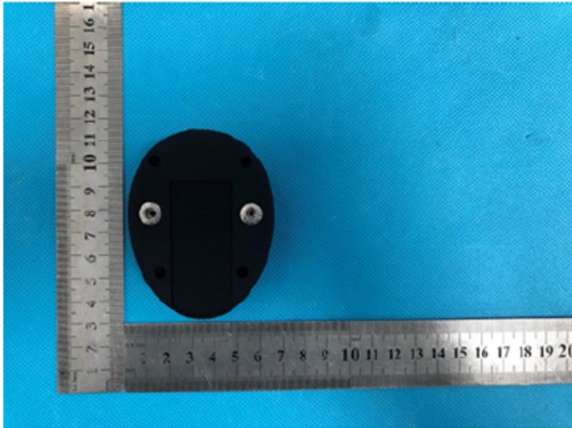
Bottom view of EUT